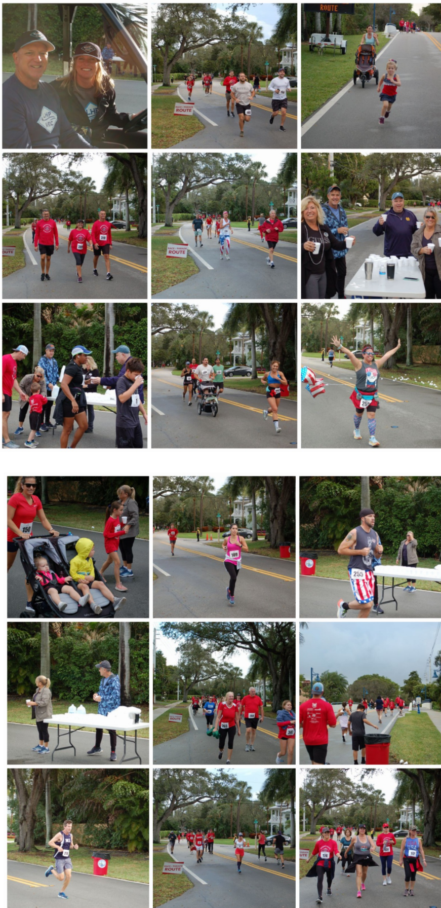
2023 Keeper's Day Parade