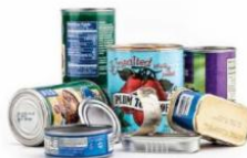
Food & Beverage Cans Latas de alimentos y bebidas