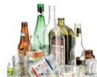
Glass Bottles & Containers Botellas y frascos de vidrio

Do NOT include in your mixed recycling cart: