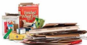
Flattened Cardboard & Paperboard Cartón y cartulina aplastados