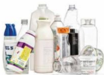
Plastic Bottles & Containers Botellas y envases de plástico