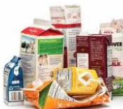
Food & Beverage Cartons Cartones de alimentos y bebidas