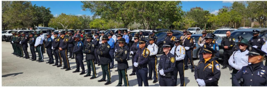
Police Department and four from the Fire Department.