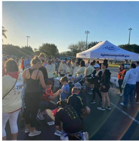
Keeper Days Parade 2024